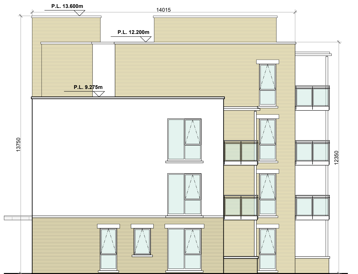
BLOCK 'A' (SOUTH-WEST) ELEVATION @ 1:100