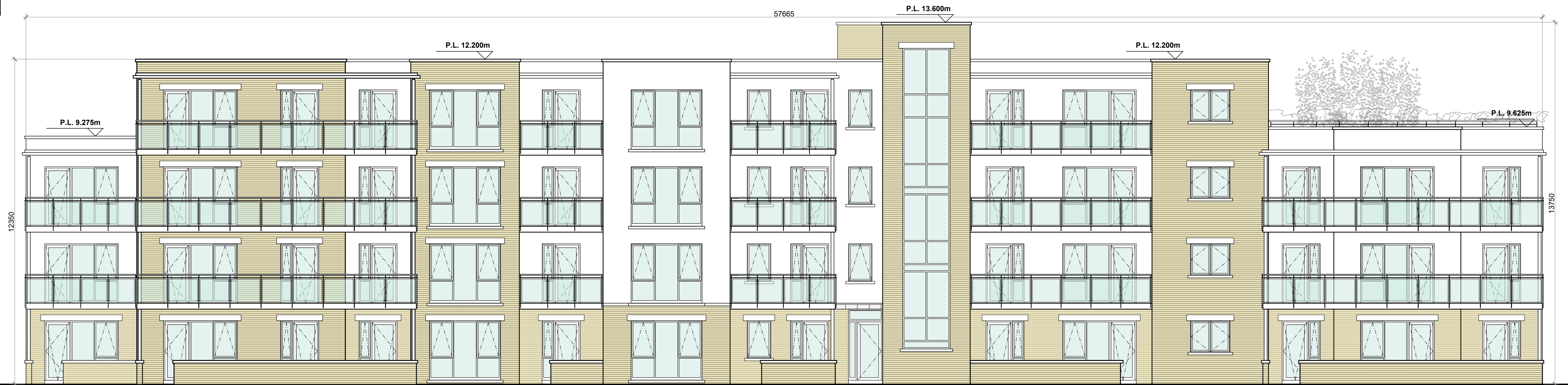
BLOCK 'A' (SOUTH-EAST) ELEVATION @ 1:100