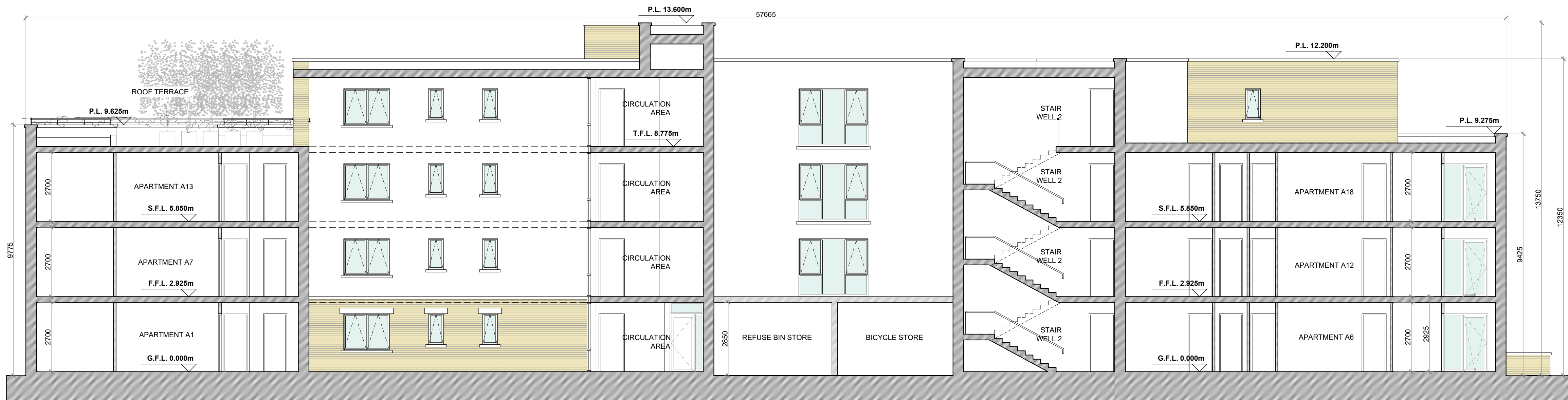
BLOCK 'A' SECTION A-A @ 1:100