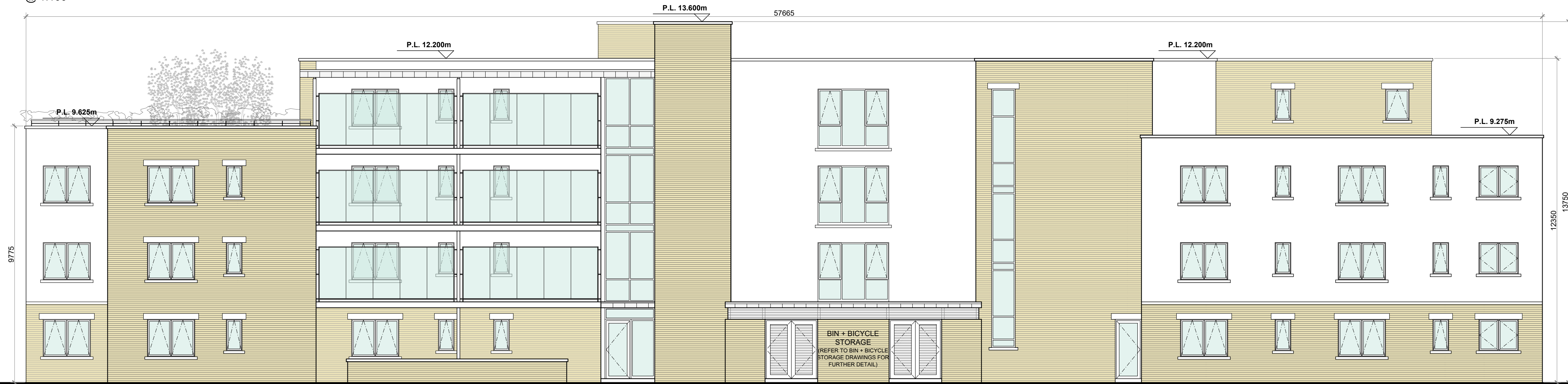
BLOCK 'A' (NORTH-WEST) ELEVATION @ 1:100